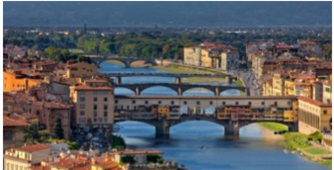
Arno River, Florence