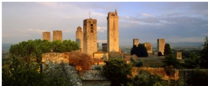
Towers of San Gimignano